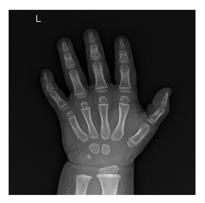
Figure 1. Bone age of patient Bone age was 4.1 years of age using the method of Greulich and Pyle.

Computed tomography of pelvis showed an enlarged uterus for age, and the right ovary was of normal size, but the left ovary was enlarged, measuring 1.6 \times 1.7 cm (ovarian volume: 2mL) (Fig. 2). Brain and pituitary MRI showed a normal pituitary gland with a mild elongated height compatible with the change of CPP, but no other organic causes for CPP were detected (Fig. 3).