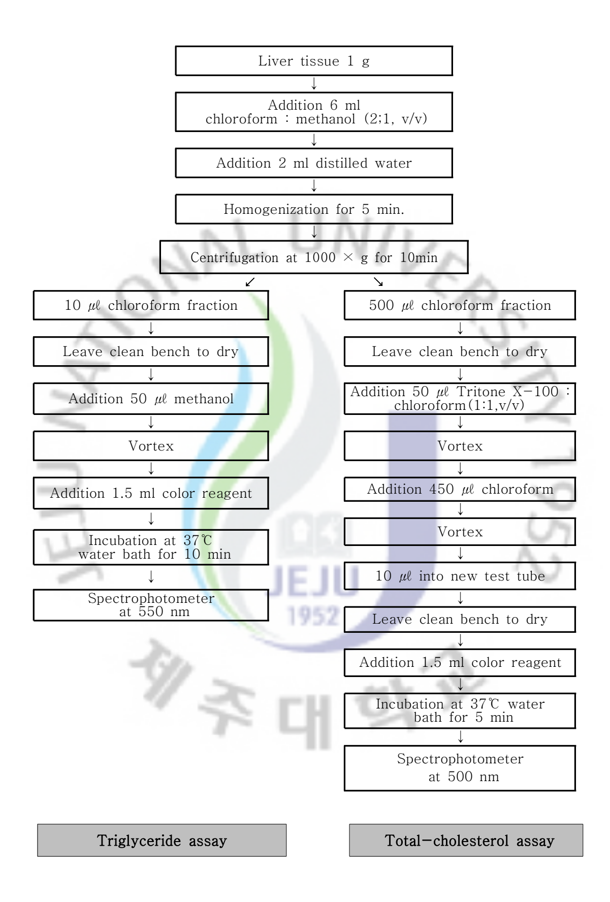
Figure 1. Analytical Scheme for Extraction of Liver Lipids